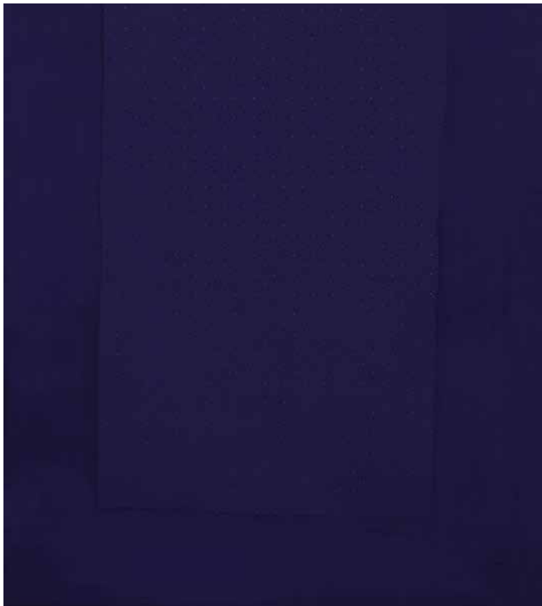
Alison Hall, Soffito I , 2017, oil, graphite, plaster on panel, 13 x 11 inches