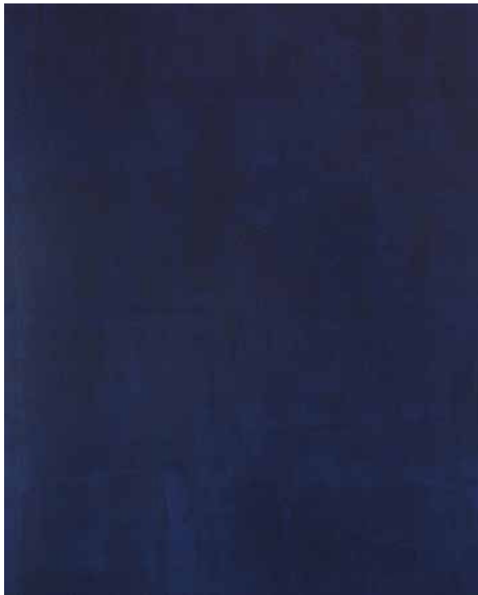
Alison Hall, Maiden , 2017, oil, graphite, plaster on panel, 91 x 71 inches