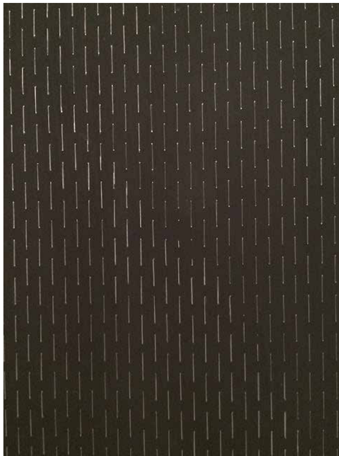
Alison Hall, Ancestral , 2017, detail

Alison Hall makes paintings on panels coated with Venetian plaster, some painted black and some painted a deep ultramarine. These supple black or blue fields become the “arenas” for an intricate dance of graphite mark-making on a grid of tiny dots. The silvery graphite floats like a mirage on top of the dark matte fields, then disappears as the viewer’s position changes. The marks follow a systematic program, but the system is often interrupted by glitches or directional changes. Particularly in the two large paintings here, the combined effect of the field and the marks assumes an intuitive organic quality, like dark flowing water, or constantly shifting winds. In many of the smaller works, the dot matrix forms a continuous grid against a blue or black field, evoking a schematic night sky, or Giotto’s luscious Arena Chapel ceiling - embodiments of the infinite or the sacred. There is an immediate sense of necessity embedded in these works, and in the arduous nature of Hall’s process - a deep connection to cultural history, to the emotional resonance of tradition, and to the inherent humanity in the ancient practice of making.