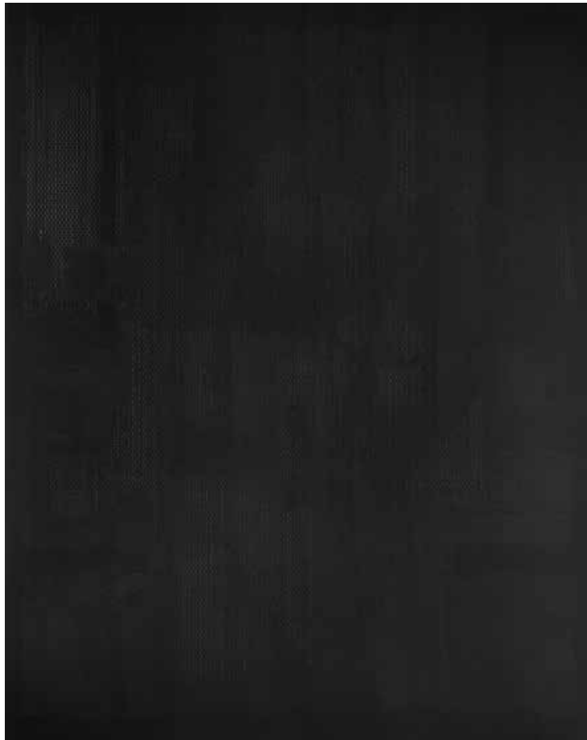
Alison Hall, Ancestral , 2017, oil, graphite, plaster on panel, 91 x 71 inches

Alison Hall: unannounced at TOTAH on Stanton Street through December 17